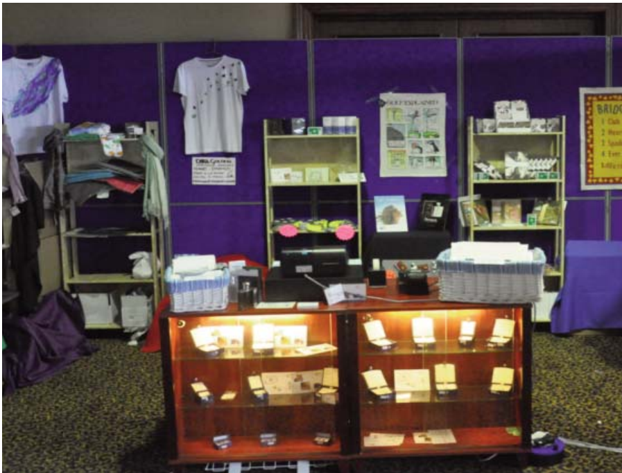
The championship souvenirs are located on the first floor

Meanwhile the Seniors are starting to arrive in readiness for the start of their event on Saturday.